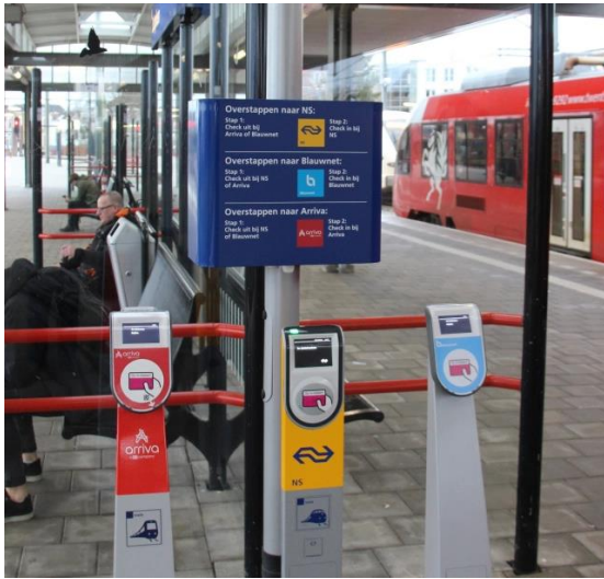
Check-in post at the train station