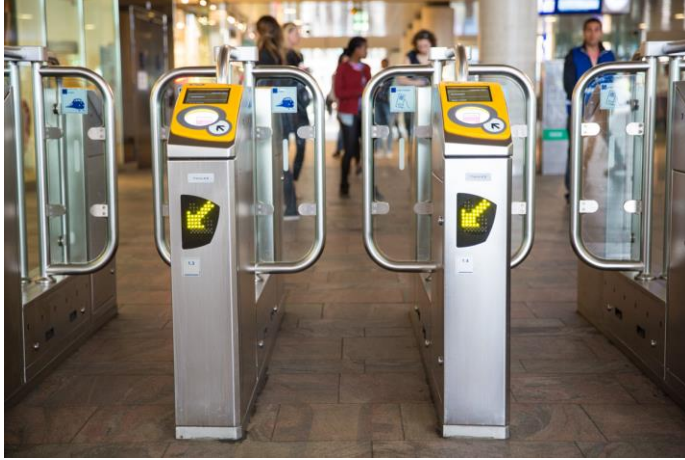
Check-in gate at the train station